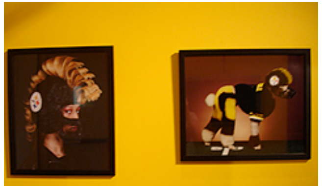
dog groomed by its owner Justine Cosley Photograph 20' tall x 24" wide 2009